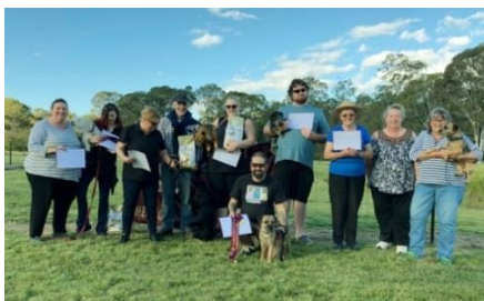
Qualifying Certificate winners at the 17 th DCNSW Earthdog Tests